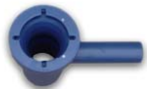
Flush and pipe mount receptacles